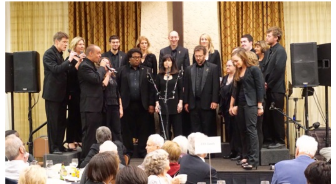
RSVP entertained a packed banquet room.