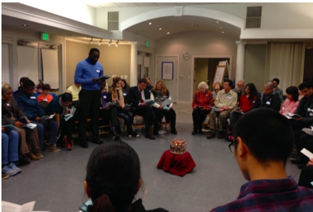
International House, Davis