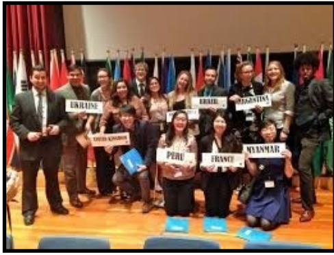
IGMUN Students at SF State University

"Saturday's joint venture -- the 4th IGMUN (Inter Generational Model United Nations at San Francisco State)-- produced the terrific results we'd hoped and planned for!"*